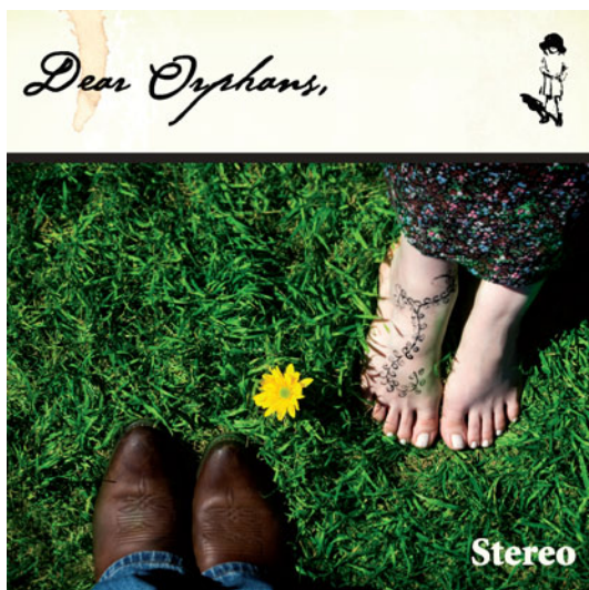
"Dear Orphans'" (P) 2009